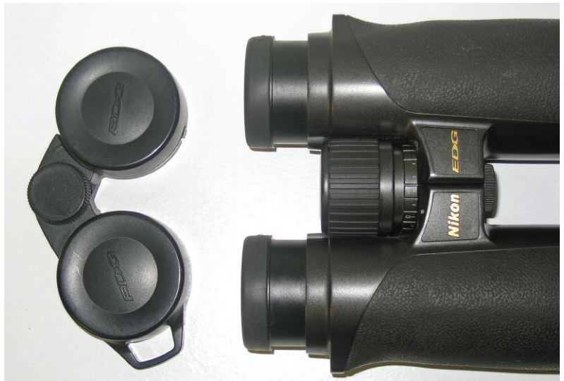
Two aspects of the EDG are problematic. One is a hard rain-guard that seems “over-engineered.” The other is the sleeve over the focus wheel for adjusting the diopter; it disengages too easily. Both of these problems are being addressed by Nikon, however, as the EDG is tweaked before final production.

I will preface the following comments by reiterating that I reviewed a pre-production model. When you take a look at the Nikon EDG at your favorite birding store, be aware of