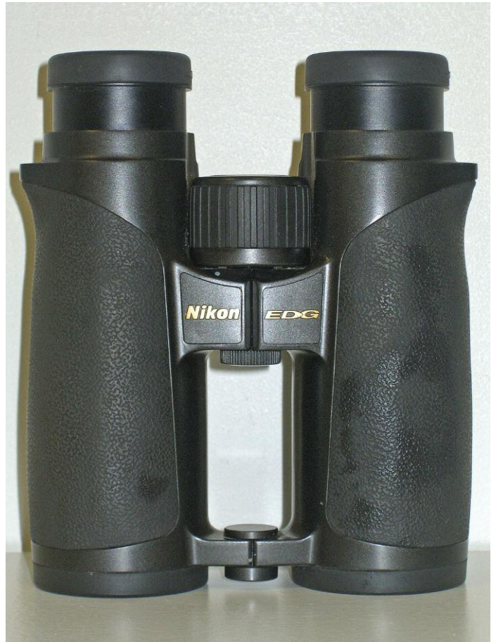
The double-barreled EDG is the first binocular that Nikon has designed specifically for birders, providing some major upgrades over the previous high-end offerings from the company. The EDG is positioned among the very best optics on the market.

The outer shell is comfortable, and it is not slick, even in very wet conditions, such as in extended rainforest downpours. Weighing in at 28.6 ounces for the 8× (28.9 ounces for the 10×), the EDG is slightly heavier than most of its high-end competitors, but the excellent balance makes up for much of that difference. The EDG feels durable. It has passed the “faceplant into a frozen snowbank