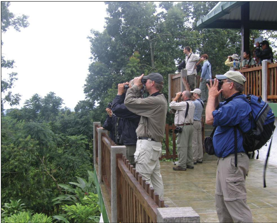
Nikon's extra-low-dispersion glass is especially welcome in such venues as the Guatemalan rainforest, as here, where leading North American optics authorities field-tested the EDG. Patricinio Preserve, Guatemala; 5 June 2008.

be necessary. For example, when I am wearing eyeglasses, I need to extend the eyecups a couple of millimeters for maximum success. Unfortunately, they cannot lock into this position, which soon becomes a real nuisance in the field, as I find I need to readjust the eyecups nearly every time that I bring my binocular to my face.